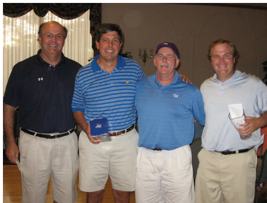
A winning foursome at the 2008 event!

If you are unable to participate, you can show your support by making a tax-deductible donation.