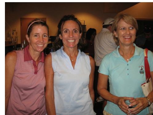
Three of our golfers enjoy the post-tourney reception

St. Ann's is a 501(c)3 charitable organization.