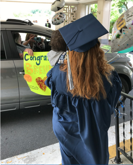
During the pandemic, we celebrated academic successes with drive-through graduation parties!